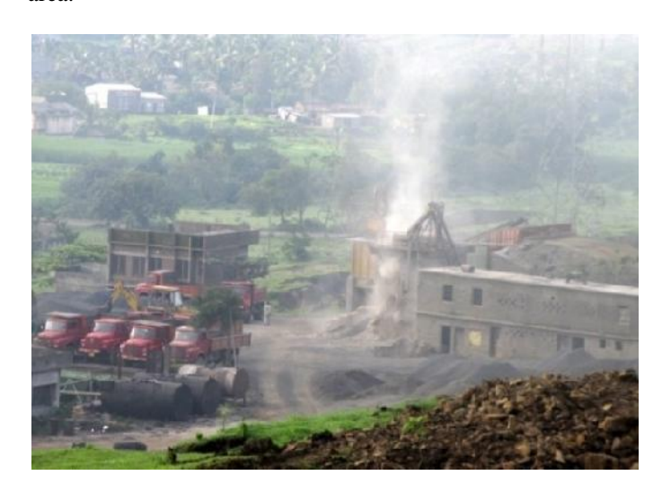
Fig. 4 Crusher emitting dust near village Top

Top, Chipri, Borawade Abdullat and Borpadale have presence large number of stone crushers closely located to the residential area