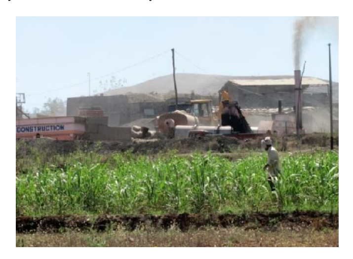
Fig. 6. Stone crushing activity close to agricultural land at near village Borawade

these fruit trees. The available water sources in the study area varied from one site to other which included groundwater sources such as well water, hand pumps, tube wells and surface water sources such as stream, canal and tap water. When enquired about the availability of water source, some (34%) said that they experienced scarcity of water. However, the response about the scarcity of water was more evident from sites at Top (72%), Abdullat (65%) and Chipri (60%). The respondents from these sites were very sensitive about this problem and alleged that the stone quarrying activity has disturbed the aquifers, resulting in reduction in the groundwater level. This in turn had also affected the agriculture yield due to non availability of water source.