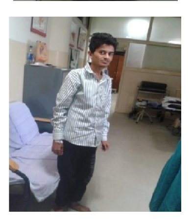
Fig.1. Muscle wasting and short height of the patient