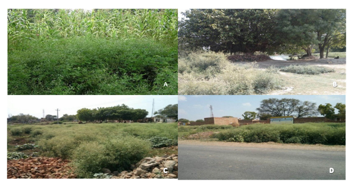
Fig. 1: Parthenium hysterophorus grown at different places: A) agriculture fields, B) & C) vacant lots, D) road side

Parthenium weed has serious impact on each and every component of the ecosystem. Some of these are discussed below: