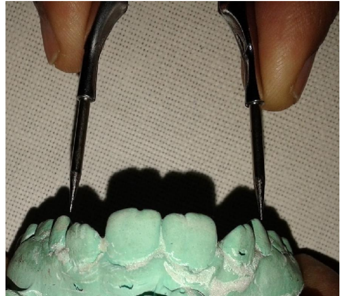
Measurement of inter-canine distance by divider (on cast)