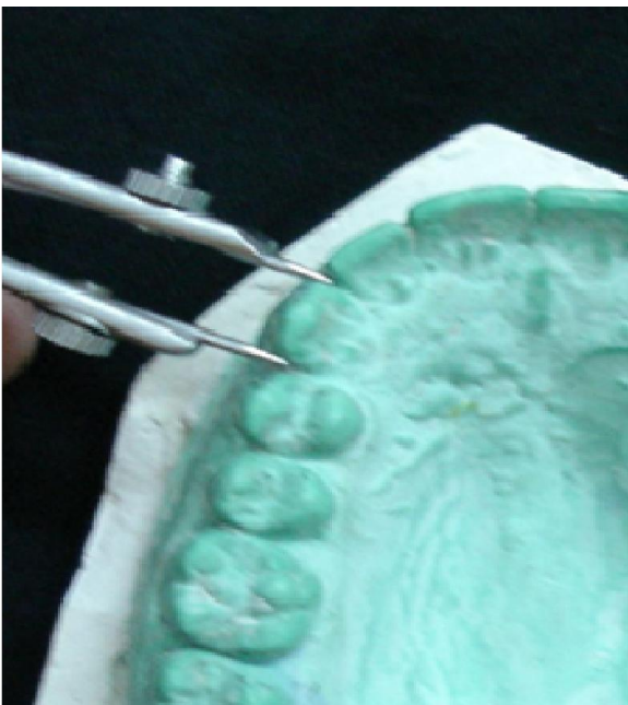
Measurement of canine width by Divider (on cast)