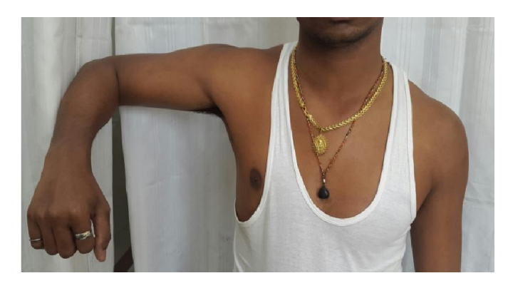
Figure 5(a). Range of active abduction at 8 weeks follow up

Spica cast was continued for 4 weeks and free active movements were started at 4 weeks after the removal of cast. Resistance movements were started after 6 weeks since spica application. After 2 months, the patient was painfree (UCLA – 33/35) and had recovered complete range of motion (abduction and internal rotation) of right shoulder joint (Figure 5a, 5b).