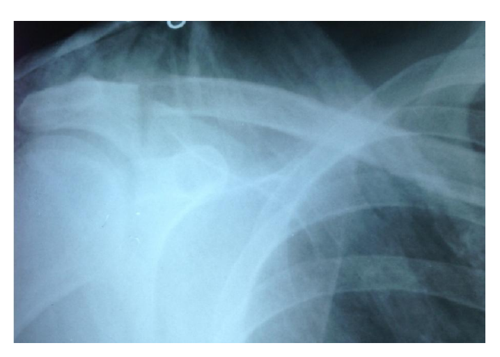
Figure 4. Check X ray at follow up two weeks post Spica