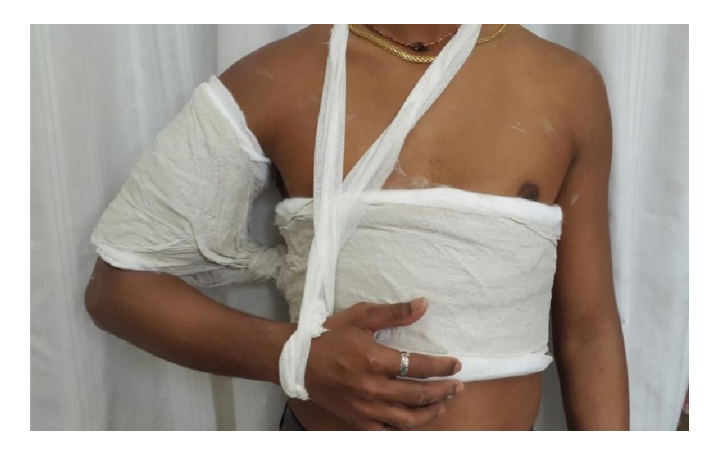
Figure 3. Shoulder spica cast in 45 degrees of abduction after reduction of the scapular spine under image intensifier

the next day and was followed up in out patients department every week. A weekly check X-ray was taken to look for any displacement at the fracture site. (Figure 4)