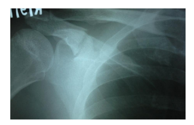
Figure 1. Initial Radiogragh Showing Minimally Displaced Fracture of Acromion Spine

On radiological examination, there was a fracture at the lateral aspect of spine of the right scapula with minimal displacement. (Figure 1) This fracture can be classified as a type 1 fracture as per Kuhns classification (unidsplaced or minimally displaced acromion spine fracture, no reduction in subacromial space) (Kuhn et al. , 1994) (Figure 2)