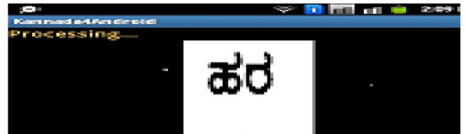
Figure 1. Processing the image

The picture of the printed/written Kannada text will be taken with the help of a built in camera. And this image is then processed by converting it into a gray scale image which the application can read. It is as shown below,