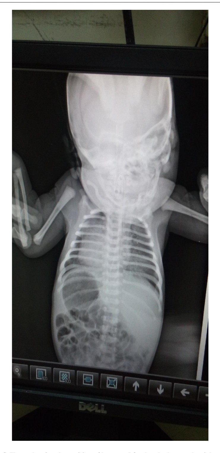
Fig. 3. X-ray showing the position of heart and fundus shadow on the right side

Also called a looping defect, it is an abnormal congenital positioning of heart on the right side (Tabry et al. , 2001). Situs tells the position of cardiac atria and the viscera. 'Solitus' is the 'normal' position and 'Inversus' is the 'reverse' position. SitusInversus Totalis is SitusInversus with Dextrocardia i.e. mirror image of normal anatomy. It is a rare condition with a prevelance of 1:10,000 in some population (Oppido et al. , 2004). It is generally an autosomal recessive genetic condition, although it can be X - Linked or found in identical twins (Radhika et al. , 2011). In human, the left – right axis is determined at the beginning of the embryonic development