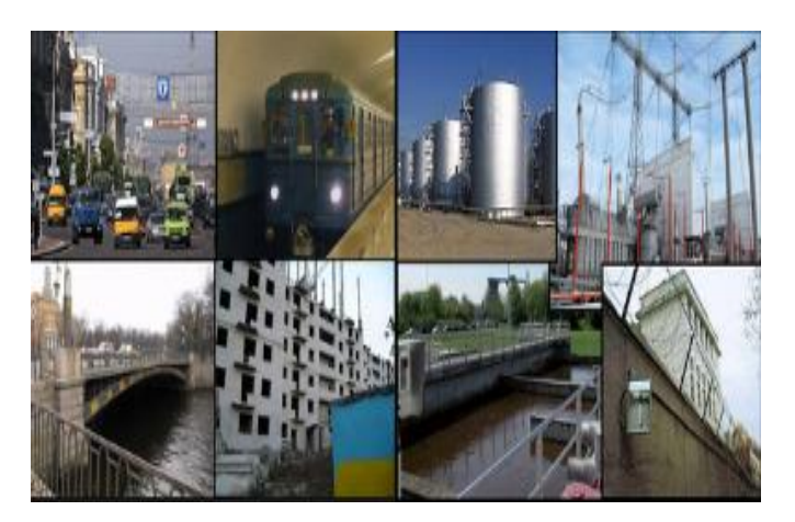
Figure 1. Applications of camera surveillance systems

and added pixel by pixel and then averaged. This will reduce the random noise.