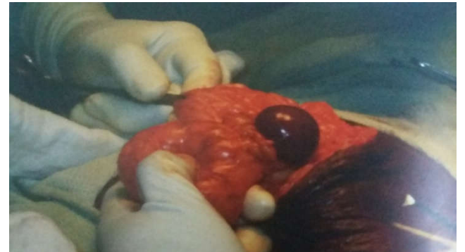
Figure 3. Strangulated umbilical hernia