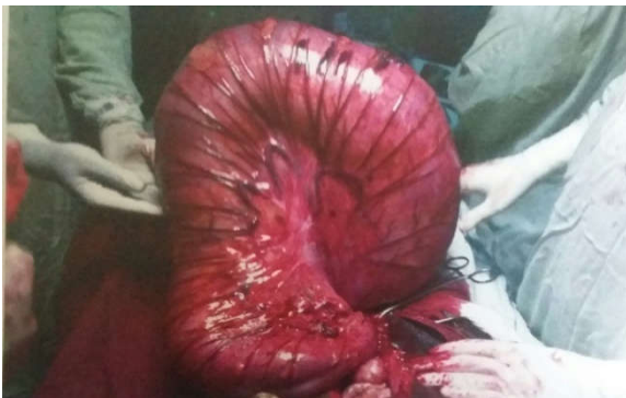
Figure 1. Sigmoid volvulus with distended sigmoid colon

They are the most common cause of intestinal obstruction in western world (Edward et al. )