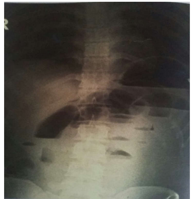
Figure 4. X Rays in acute intestinal obstruction with multiple air fluid levels