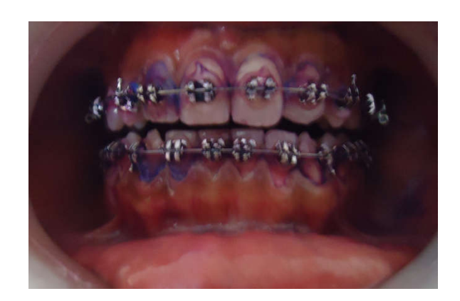
Fig.3. After Disclosing Agent Rinsed

5. Plaque index (Bonded Bracket Index)<sup>1</sup> for bracketed teeth to determine the amount of microbial plaque accumulation on teeth is used to evaluate plaque accumulation