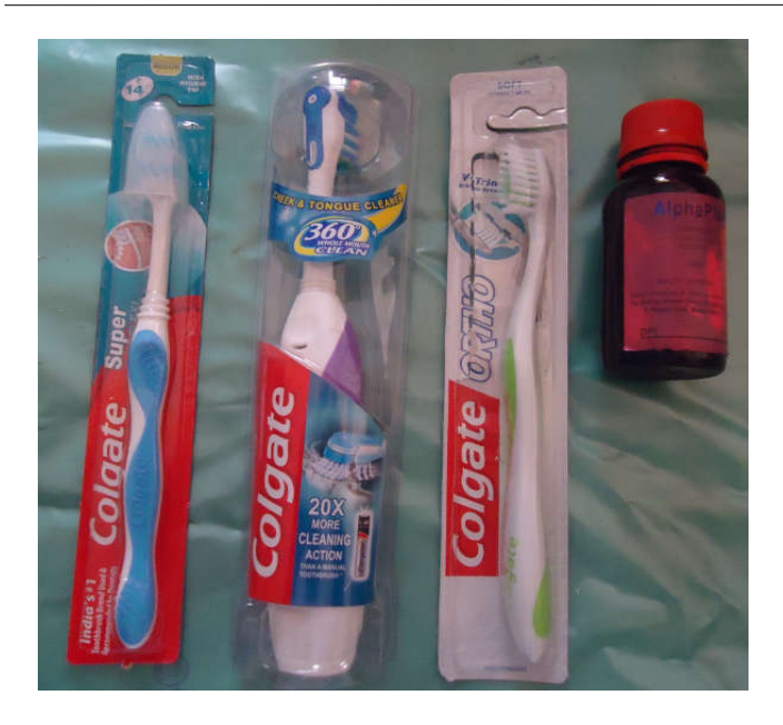
Fig.1. With Three Tooth Brushes And Disclosing Solution

All patients were divided into three groups A, B &C and with each group consisting of 10 subjects. The study was conducted over a two week period dedicated for assessment of each type of tooth brush.