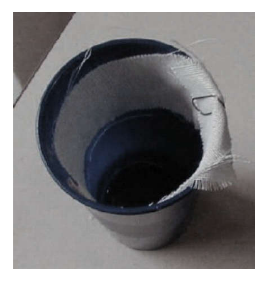
Figure 2. Oviposition container with substrate

(MH 2) and male hostel bus stop (MH) respectively. These 7 location sites were points within 1-Km radius of the hostels as such, a single ovitrap was used for sampling each site. All ovitraps were layered with cream coloured fabric as a substrate on the inside, according to the method described by Service (2012). The traps were labelled with code numbers representing each location after which, three-quarter of the ovitrap containers were filled with water. All the ovitraps were placed in suspected mosquito breeding sites for 24hours in contrast with weekly collections observed in many studies due to time constraint. However, it was considered that the results observed in a daily collection and that observed in a weekly can be equitable since