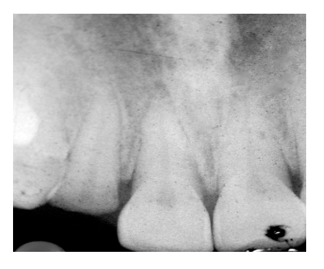
Figure 2- Preoperative Radiographs