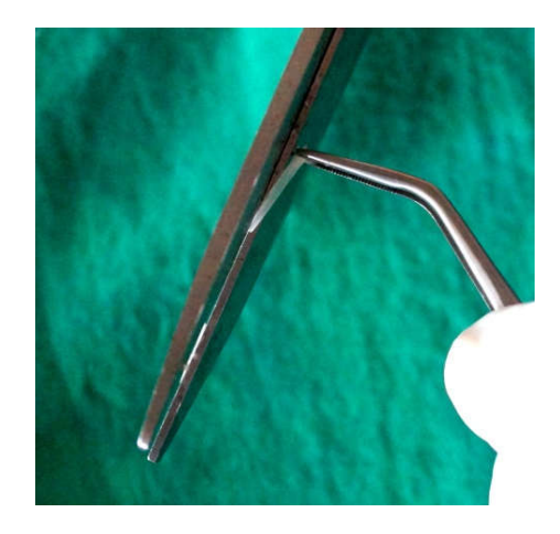
Figure 6. With the help of sharp scissors, the EverStick fiber was cut

The restorative procedure was completed by building up the tooth incrementally with a direct resin composite restoration of an appropriate shade. The occlusion was carefully adjusted to avoid any primary contacts or traumatic occlusal forces to the restored tooth. Finally, the composite resin crown restoration was polished with a composite polishing kit. An intraoral periapical radiograph was taken to view the same (Figure 9).