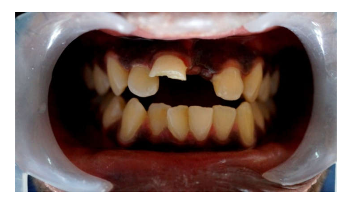
Figure 10. Preoperative View