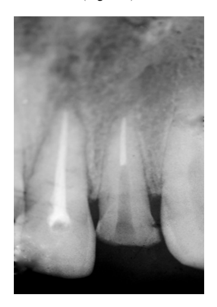
Figure 4. Post space preparation done irt 22

A dual-resin cement was applied with a lentulo spiral into the post space as a luting agent. The post was then inserted into the canal. Excess resin cement was removed and the cement was light cured for 40 seconds (Figure 8).