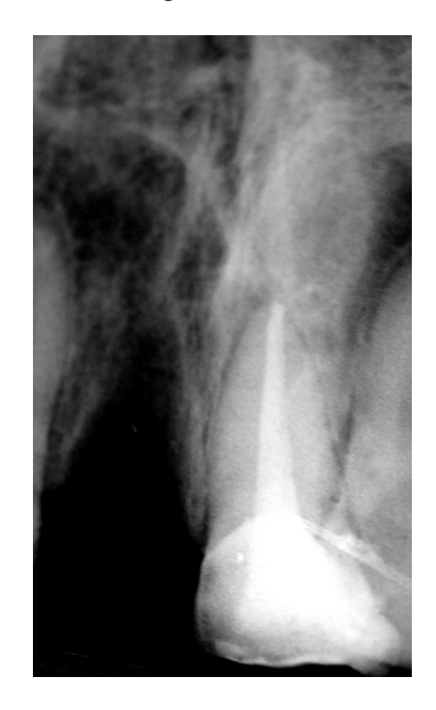
Figure 11. Radiograph show obturation irt 11

A 24 year old male patient reported to the department of Conservative Dentistry and Endodontics, KVG Dental Caollege and Hospital, with the chief complaint of fractured upper front teeth from an accident that occurred 2 days ago at that time (Figure 10). The root of the tooth 11 was treated endodontically and filled with guttapercha and sealer (Figure 11). Post space preparation was done in the second visit with 5 mm of guttapercha left at the apex of the root. In this case the root canal size was large. The canal was rinsed with saline and dried carefully using paper points. With the help of sharp scissors, the EverStick fiber was cut to a suitable length and the posts were manipulated with tweezers to adapt to the canal walls. Two posts were needed in this case as the root canal space available was too large.