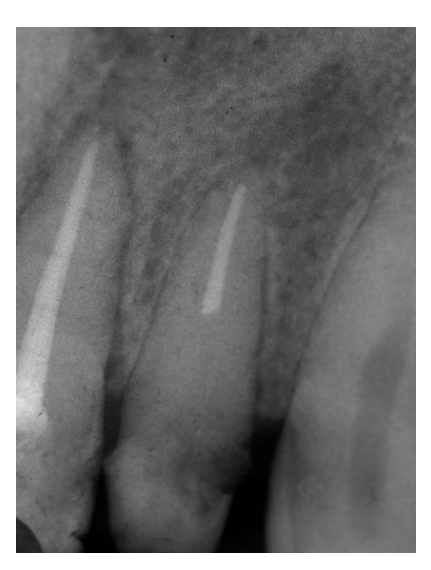
Figure 9. Postoperative Radiograph