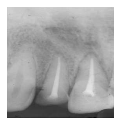
Figure 3- Radiograph showing obturation irt 21 and 22

In the first visit, single visit root canal treatment was carried out in relation to 21 and 22 (Figure 3). In the next visit post space preparation was done irt 22 keeping in mind not to enlarge the canal. 5 mm of guttapercha was left at the apex of the root (Figure 4). The canal was cleanedby rinsing with saline and paper points were use toair dry. The depth of the prepared canal and the estimated height of the coronal structure to be buildup were measured. The root canal walls were etched with 37% phosphoric acid for 15 seconds, washed with spray, and then air dried. To fit with the diameter of the canal, GC EverStick Post with a diameter of 1.2 mm was used (Figure 5). With the help of sharp scissors, the EverStick fiber was cut (Figure 6) to a suitable length and the posts were manipulated with tweezers to adapt to the canal walls (Figure 7). Later, two consecutive coats of bonding agent were applied to the canal with a microbrush and air dried, and then cured with LED light curing unit was used to cure the same. After checking the fit of the glass fiber post inside the root canal, the post was also light cured for 20 seconds.