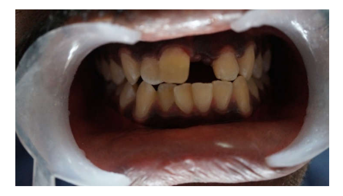
Figure 14. Postoperative view

When the post and cement were cured, the core was built using composite resin (Figure 14).