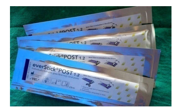
Figure 5. GC Everstick post