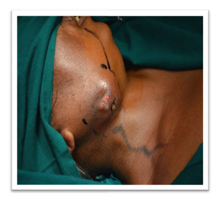
Figure 3. Incision