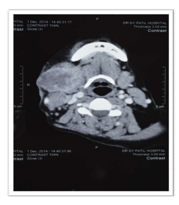
Figure 2. Computered tomography