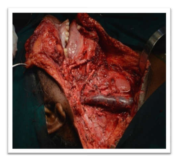
Figure 4. Modified Radical Neck Dissection