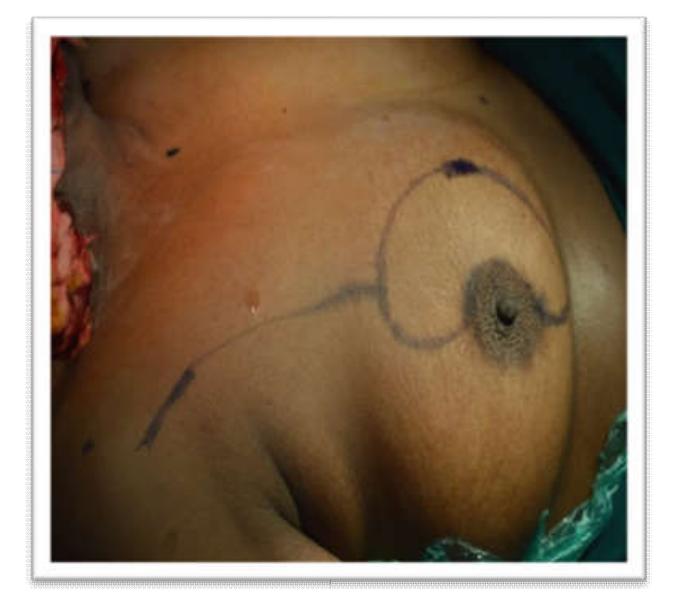
Figure 5. PMMC flap marked