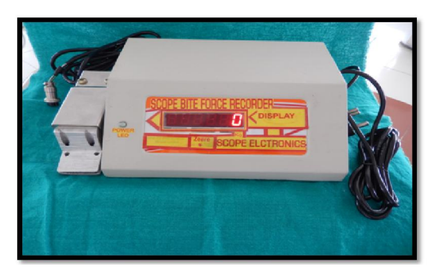
Figure 1. Bite Force Meter

explained to the parents/caretakers and written consent was obtained from them. Prior to recording of bite force, oral examination was carried out. The examination procedure consisted of two major parts: the demographic data part including the name of the child and age, sex, height, and weight, BMI, caries severity and the measurement part including the measurement of MVMBF. The MVMBF was measured bilaterally first permanent molars region (according to the dentition stage) using a portable bite force meter (Figure 1).