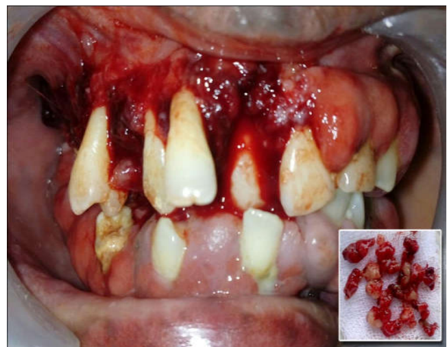
Figure 2. Surgical gingivectomy and excised tissue