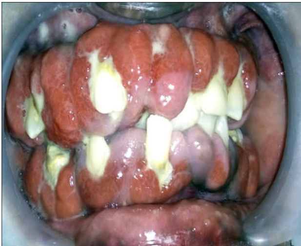
Figure 1. Intra oral picture showing the gingival overgrowth

Cardiologist consent was obtained with the necessary investigation like INR and Prothrombin time (PT) levels were assessed which was under normal limits and the hemoglobin level was found to be normal. Informed consent was obtained from patient before surgery. Surgical gingivectomy was planned in four sessions. Accordingly warfarin was withdrawn 4 days prior to procedure under physician guidance. Patient was posted for surgery in the morning hours and her regular medication and symptoms were monitored prior to the procedure. Quadrant wise gingival excision was performed under local anesthesia (LOX 2% without adrenaline) in 4 sessions with 1 week interval (figure 2). We had to stop the procedure intermittently due to the symptoms exhibited by the patient. However the soft tissue responded favorably during healing process and post op follow up was uneventful. The excised tissue was sent for biopsy and the report revealed hyperplastic and keratinized epithelium with highly fibrosed connective tissue with focal proliferation of fibroblasts and areas of proliferating blood vessels in a background of chronic inflammatory cells (Figure 3). After 1 month follow up (Figure 4, 5) gingival tissue was near normal and patient was able to masticate, swallow and speak and her warfarin was re started 1 day after the completion of surgery. Patient is on regular follow up, however recurrence of gingival overgrowth was explained to patient due to medications for her condition.