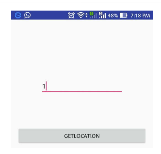
Fig. 2. Android app along with vehicle ID

When a valid vehicle number is entered, the app directs the user to the Google maps in which the current position of the vehicle will be displayed (Marufi Rahman et al. , 2016).