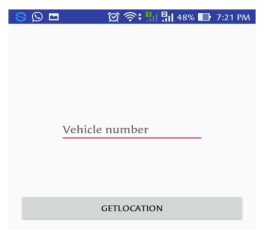
Fig. 1. Android app

In this proposed system, the current position of the system is updated in intervals of time and is made available to the user whenever asked. The GPS modem gives the latitude and longitude of the vehicle, with a unique identification number, which is then passed to the Arduino board with ATmega328 microcontroller. The data in the microcontroller is then given to the Wi-Fi shield which gives connectivity to the server. The server gets updated with the data from various vehicles included in the system. The Android application is used by the user to get the position of the desired vehicle.