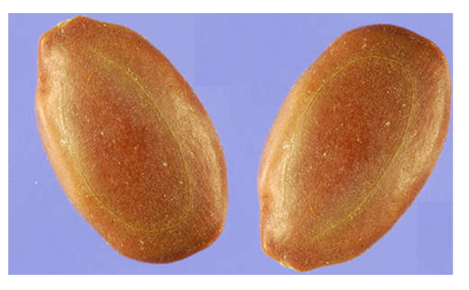
Fig. 2 Seeds of P. juliflora

The genus Prosopis is widespread and consists of 44 species, mostly thorny trees and shrubs. It is armed with stipular spines. Leaves have 1-2 sometimes up to 4 pairs of pinnate; the number of leaflets could be 6-29 pairs with glabrous surfaces. Flowers are yellowish. The pod is pale brown, linear, straight or slightly curved, 8-29 cm x 0.8-1.7 cm, compressed and with a sugary-pulpy mesocarp (Asfaw and Thulin, 1989; Vilayati, 2000).