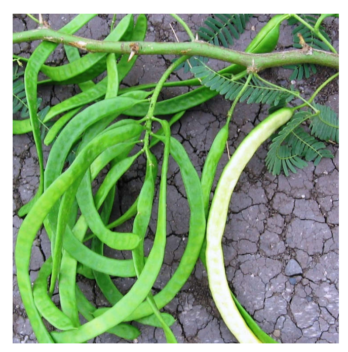
Fig. 1 Pods of P. juliflora

Prosopis juliflora belongs to the family FABACEAE (LEGUMINOSAE), subfamily Mimosoideae and genus Prosopis . (Figure 1 and 2 below shows pods and seeds of P. juliflora respectively).