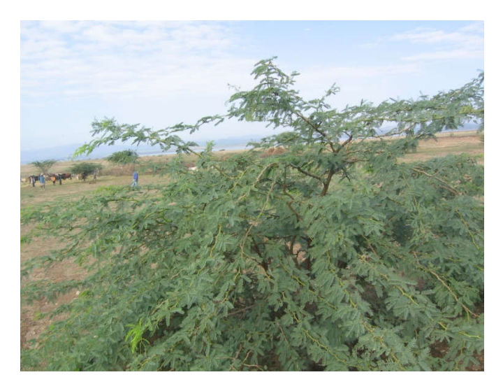
Fig. 4 P. juliflora on Tef ( Eragrostis tef ) farm around Metehara town, Ethiopia