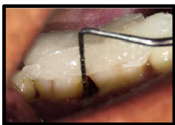
Postoperative-9 months later

months (0.001) and from 6 months to 9 months (0.037) in group B and from baseline to 6 months (0.001) but not from 6 months to 9 months (0.081) in Group C.