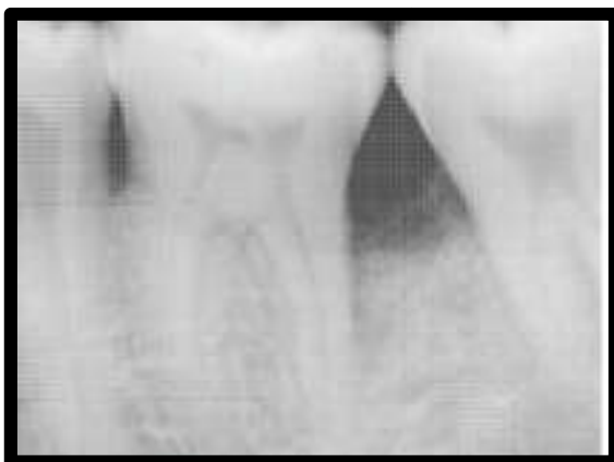
Postoperative xrays -9 months later