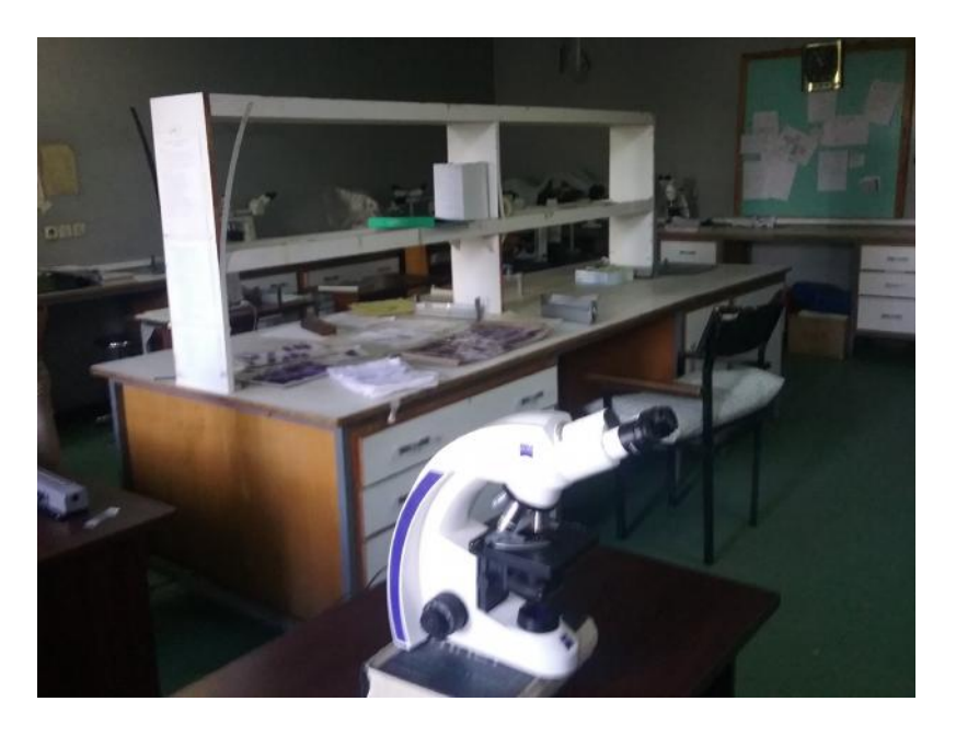
Fig 1. Pathology laboratory partial view. This is the microscope room where seniors and residents look slides under microscope. This room might have not been repaired for decades