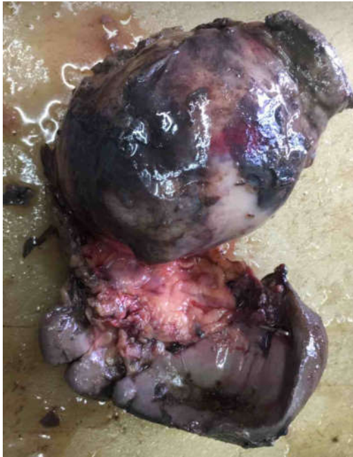
Fig.2. Pancreatic cysts with splenectomy specimen