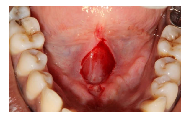
Figure 2. Scalpel incision