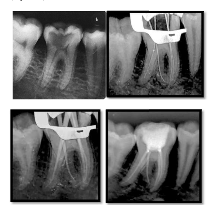
Figure. (a) Pre-op IOPA x-ray. (b) Working lenght Determination, (c) Master Cone. (d) Obturation

relation to lower right first molar. The tooth is anesthetized. Access opening was done and two mesial canal orifices (mesiobuccal, mesiolingual) and one distal canal orifice (distobuccal) were initially located. Another orifice was located on distolingual part of the pulp. IOPA was taken which revealed an Extra canal (Disto lingual canal). Floor on further exploration. The root canals were explored with a K-file ISO number 15 and radiographic length of the root canals were determined (Figure 1b) and confirmed by apex locator. Biomechanical preparation was done with protapertill F1 files. (Dentsply, Switzerland) in all the canals and canals were irrigated with 5.25 % Sodium hypochlorite, 17% EDTA and 2% Chlorhexidine. Was used as final irrigant and irrigation activation was done by endo activator (Dentsply) (Figure 1c) Radiograph was taken for accessing master cone and canals were obturated using Guttapercha and AH Plus sealer (Dentsply, Switzerland). The access preparation was sealed and the post enodontic restoration was done with composite (Figure 1d).