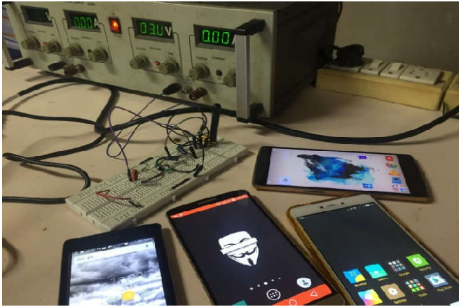
Fig.2 Connection and respective mounting for the project