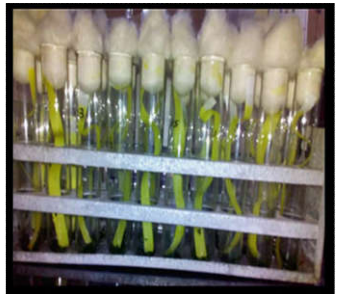
1a. Saturated picric acid paper kept overnight for colour development