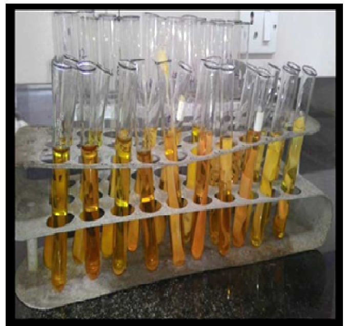
1b. Colour development after reaction with HCN evolved