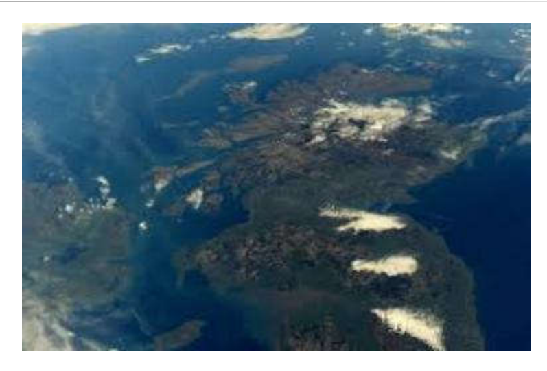
Fig. 3. Image in the dataset