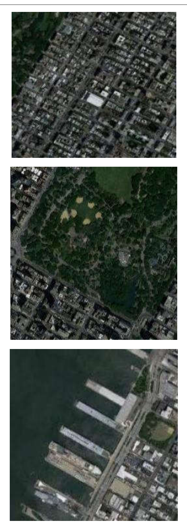
Fig. 2. The above figure shows the satellite images from the dataset

Feature Extraction: The proposed CBIR system for satellite images will be based upon color texture and shape feature extraction.