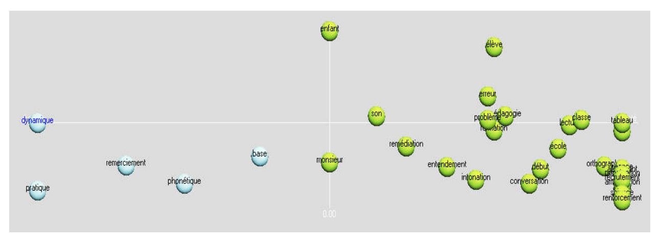
Figure 2. Graph of actors on realization of the remediation

by these learners. They then decide to put in place corrective activities in the direction of an educational remediation to "raise the level of learners precisely in reading and spelling". To identify learners in difficulty, activities must be conducted that will reveal that there are "less good" students and "good" ones to "try a little to make a difference". So, it is the "less good" students who will benefit from this educational remediation.