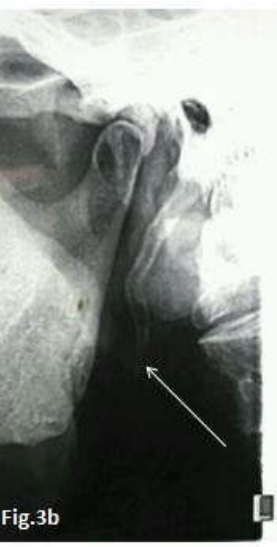
Fig.3a & 3b. OPG showing elongated styloid processes on both sides of Langlais type III morphological classification and type A radiological classification