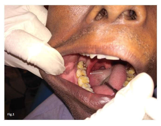
Fig.1. Intraoral clinical photograph showing the bony projection in the right tonsillar fossa

A 52 year old male patient reported to the Department of Oral & Maxillofacial Pathology with the chief complaint of burning sensation in bilateral buccal mucosa since last 3 months with previous medical history of tonsillectomy 15 years ago. Intra orally, palpating along the occlusal line posterior to the region of the tonsillar fossa a hard bony tip on the right side could be palpated (Fig.1.