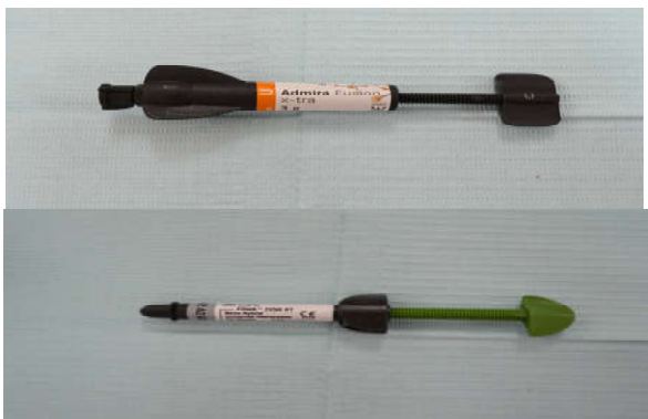
Figure 2. Nano-hybrid composite 3M ESPE Filtek TM Z250 XT shade A2

Group II: VOCO admira fusion x-tra Nano-Ormocer. The specimens were prepared by applying one bulk