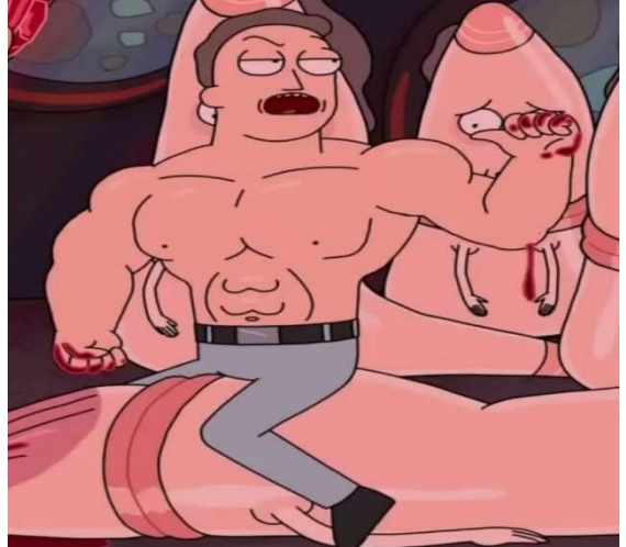
Figure 3, 4 5. Representation of Female as the monster and Jerry as the worm-like weak creature, later representations of Beth as a goddess and Jerry as muscular figure

Jerry's representation in the mind of Beth is changed to a muscular figure (Figure 5), and Beth's representation in the mind of Jerry does not change to an angel, but a powerful goddess (Figure 6). After these representations have evolved from what they were before, peace is restored. The creators of the show here emphasize on how gender roles are constructed in the minds of humans: they essentially do not have to be existing in reality. There is a clear line of difference between what is real and what we imagine to be real.