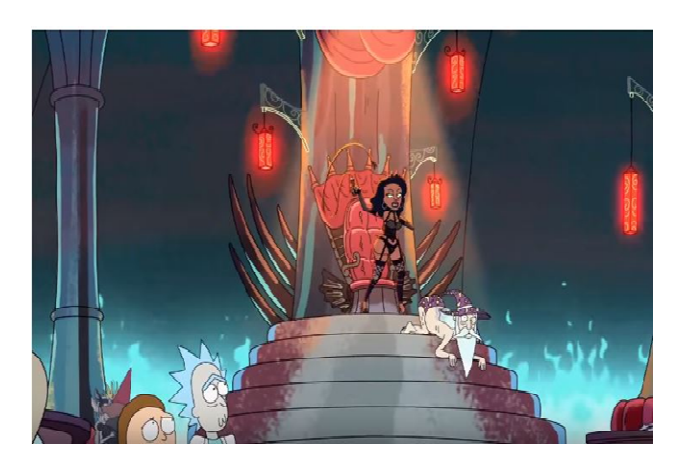
Figure 1. Mrs Pancakes in Goldenfold's Dream version<sup>1</sup>

Goldenfold's ideal version of Summer is a 16-yearoldseductress (Figure 1) who does not mind seducing boys or old men or having sexual engagements with more than one person<sup>2</sup>. Millet argues that male critics tried to construct the female in their narratives as sexual and submissive beings that admire and fear the phallus. (Millet 210) A woman's role in sexual interaction is aimed at the pleasure of the man. Man constructs her, and she behaves in exactly the same way. In this case, both Summer and Mrs. Pancakes exhibit sexual behaviour of consent and submission exactly the way Goldenfold wants. Mrs. Pancake's dream of the sex dungeon represents male's fear of women's sexuality. As Friedan talks about the fear men have of autonomous sexual beings, Mrs Pancake's dreams have been shown in extremity. Her whipping the old vision represents man's idea of the freed sexual woman as intimidating and dangerous, and the need for this sexuality to be curbed. Also, since Mr Goldenfold's dream version of Mrs Pancake's dream version does not have Mr Goldenfold in it, it also portrays man's fear of not being needed by the woman for her pleasure, which in turn makes her a monstrous sexual being.