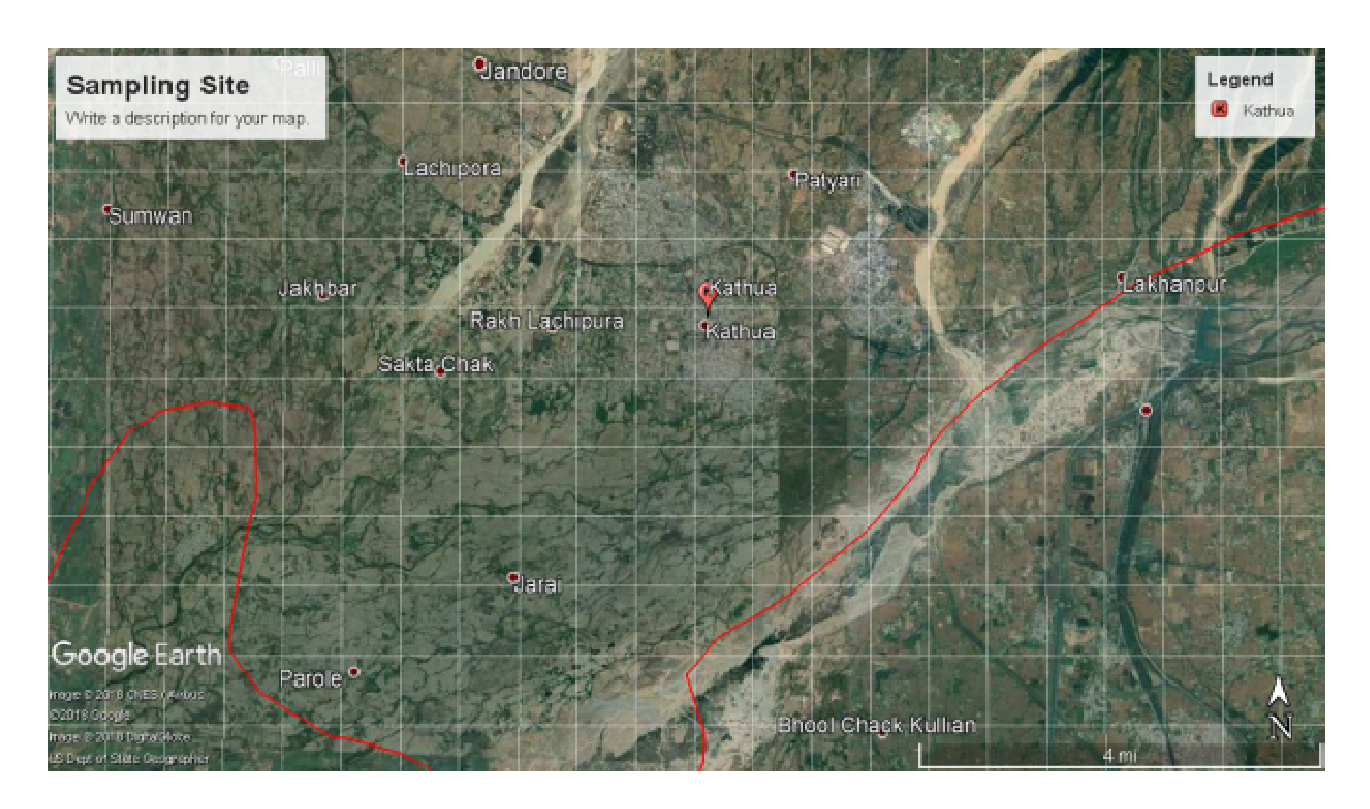
Figure 1. Water Sampling Map at Kathua, Jammu, India by Google 3D Earth Software

The Kathua town stretch between 32^{\circ}37' North to 75^{\circ} 52'Eeast longitude. The region from where, water samples were collected, GPS coordinates presented in the Table 1 and Figure 1.