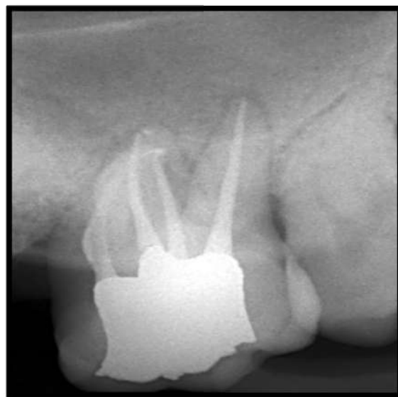
Figure 4. Radiograph after endodontic treatment