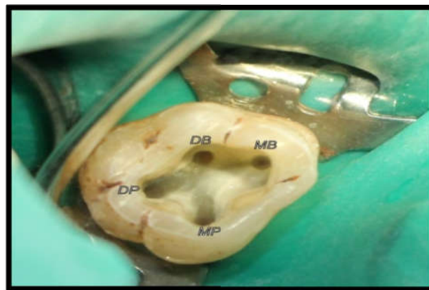
Figure 3. Occlusal view of the endodontic access showing the opening orifices of the mesial-buccal (MB), distal-buccal (DB), mesial-palatal (MP) and distal-palatal (DP)