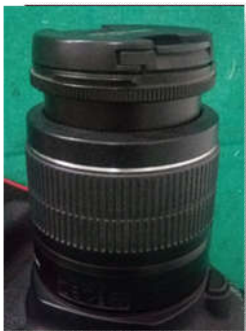
Lens of Dslr