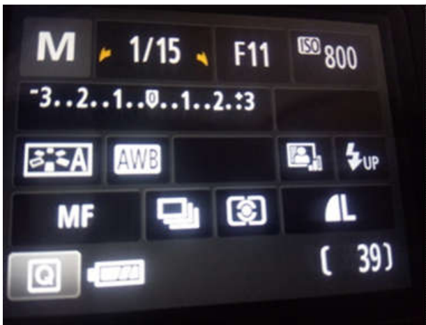
Settings in dslr

Other uses include legal documentation, publishing, education, communication with patients, dental team members, colleagues and technicians, and finally marketing. Each of these uses enhances and elevates the status of dental practice. It also improves delivery of care to patients.