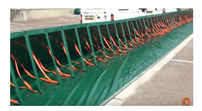
Fig. 8. Illustrates the mechanism of Rapidam flood barrier

extended by connecting the sections together allowing a 20m section to be setup in about 15 minutes (Fig. 8).