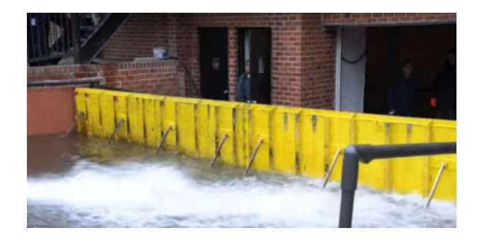
Fig. 5. Illustrates the mechanism of flood break barrier

Flood Break: The entire flood gates automatically blocks pedestrians' way from street level flooding. Without supervision or human activation of any kind, these gates are self-deployed. Under normal conditions, the gate remains architecturally blended in with the surrounding infrastructure. When flood water strikes, the rising water creates hydrostatic pressure required to activate and raise the gate firmly in its position. The rising water also activates self-ceiling rubber caskets. They keep the water from seeping through the barrier. When the barrier reaches a 90° upright position, the flood water holds the gates firmly in place. When the water recedes, the gate falls slowly back into its recess location. Thoroughly tested and built last for years, flood break flood gates have made a major impact in flood protection technology (Fig.5).