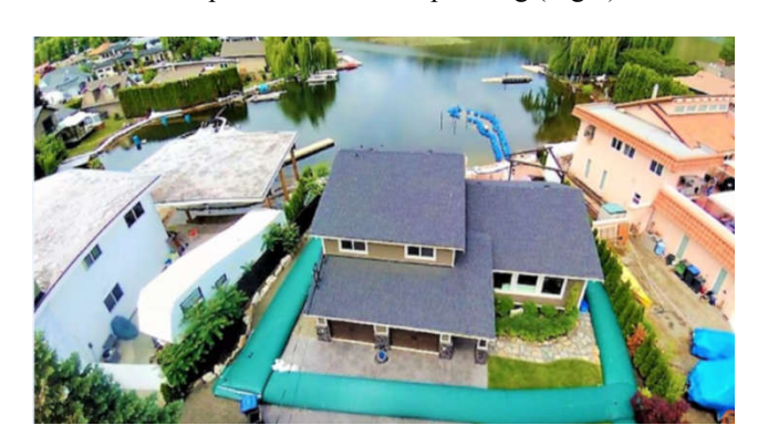
Fig. 4. illustrates the arrangement of water bloc barrier

Water Bloc: It is a simple yet amazingly effective flood barrier. The water bloc effectively stops any approaching water heading the way. This highly efficient flood barrier is used to protect homes and even entire neighborhoods. When water approaches, the water bloc does exactly what its name implies. It blocks it. It is made of high strength PVC fabrics designed to maximize punching resistance, tensile strength etc. The water bloc is a tube shaped structure incorporating (Fig.4).