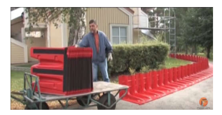
Fig. 7.Illustrates the mechanism of NOAQ flood barrier

NAOQ Flood Barrier: The NAOQ flood fighting system includes two distinct barriers that can defense much faster using less man power. The NAOQ boxwall BW 50 is a free standing flood barrier that uses the weight of flood water to retain in its place. Made of light weight, easily transportable block sections, the BW 50 can be erected by a single person. The box of BW 50 has been shown in figure 7 to be amazingly effective. It is wide enough to be united by just two people. The NAOQ tube wall consists of tube shaped sections filled by airpump and arranged in a chain-like integration including a skirt that is also anchored by the flood water. The tube walls works best. It is now being employed around the world.