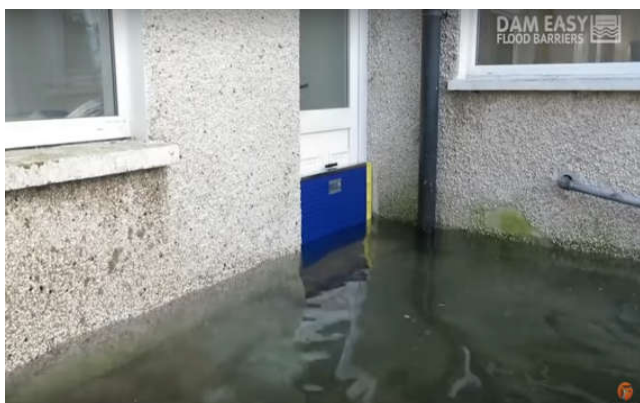
Fig. 2. and 3 Illustrates the arrangement of dam easy barrier

This provides at a 1.1m away which covers the distance of all door reveal spaces. Finally, we use the compaction handle to inflate the seal and that ends the installation of the barrier. We can provide it with some concrete works and extension pole can be installed for wider spaces that count for the use of multiple barriers. A security cover is also available to prevent dampening.