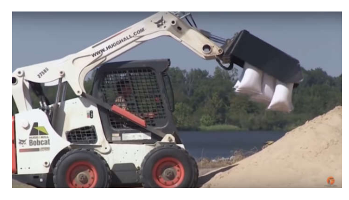
Fig. 1. Illustrates the mechanism of sand master

The sand master works by ploughing straight into the sand and fills empty bags already securely locked entire to the device. The filled bags are then carried to the drop of location where they are closed, securely tied and drop where they are needed. It is available as sand master 20 for skid steers (efficient in stacking 20 sandbags at a time) and sand master 26 for backhoes andloaders (efficient in stacking 26bags at a time). The sand masters can meet the defense between preservation and total devastation during a major flooding event.