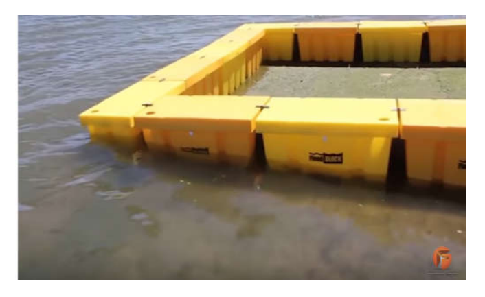
Fig. 9. Illustrates the mechanism of Flood Block flood barrier

Flood Block: It is a robust, flexible flood barrier that can be rapidly deployed by one person. The flood block can be computed in any length and in any direction required. Its ability to form shut corners is awesome and perfect for creating various shapes. This allows the flood block to be used in entire home or business. Flood block units can automatically fill with the rising flood waters. Flood blocks are light weight, stackable and can be deployed amazingly fast. With its convenient portability and conformable design, the flood block stands ready to block the water whenever water rises in its level (Fig.9).