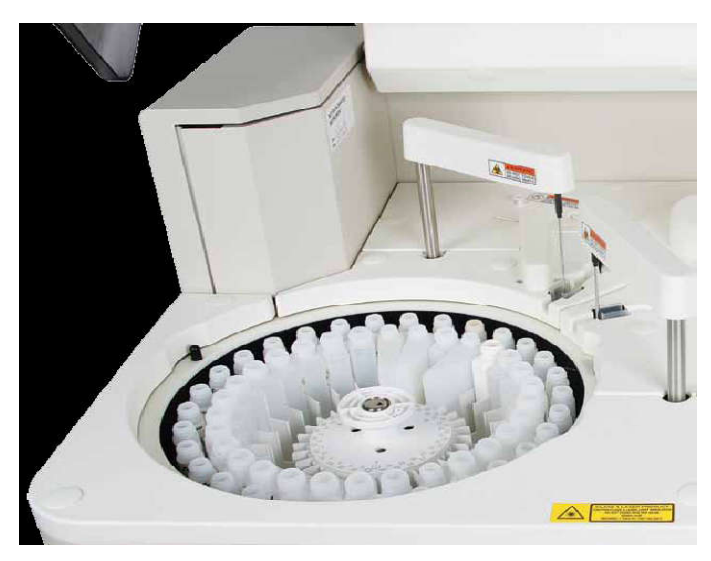
Photograph 2. Randox RX Imola for serum bilirubin analysis using photometric method