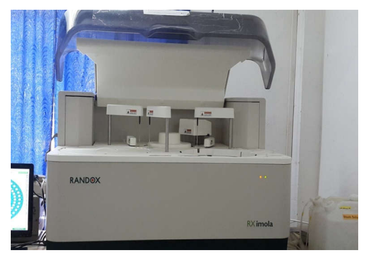
Photograph 1. Randox RX Imola for serum bilirubin analysis using photometric method