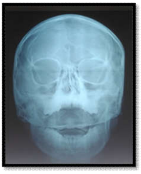
Pre Operative Photographs