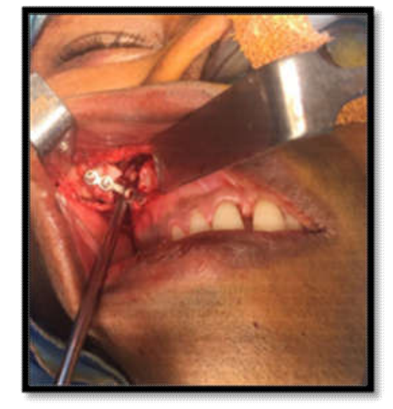
Intra Operative Photographs