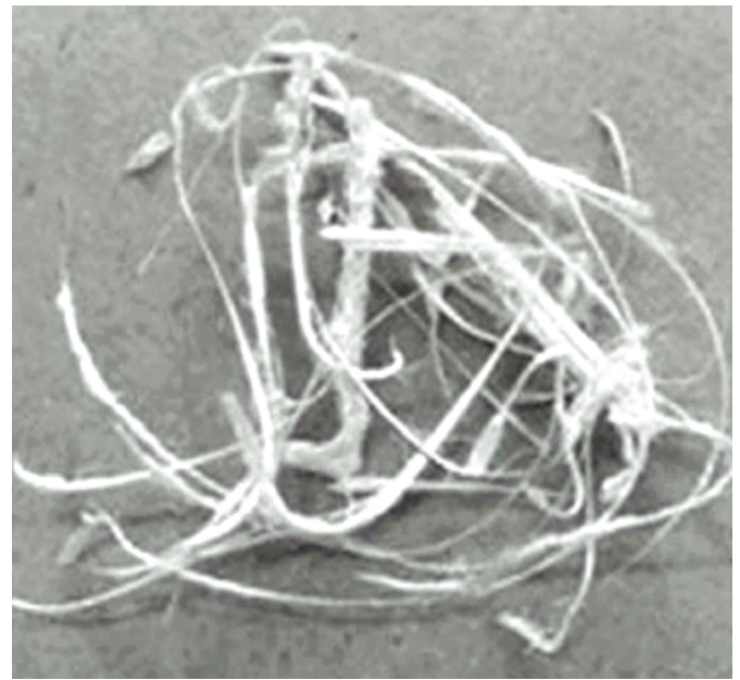
Degradation of white chicken feather after Bacterial incubation.

Removal of As(V) from the growth media and reduction of As(V) to As(III) by Bacillus licheniformis DAS-2. Y-Axis represents the concentration of As(V) and As(III) in residual media at different time point (X-axis) of growth phase at different concentration of As(V) enrichment (A) 3mM As(V), (B) 5mM As(V), (C) 7mM As(V) and (D) showing total arsenic in residual media at different time point of growth phase at different concentration of As (V) enrichment. All values are mean of three replicates and standard errors (SE) are presented as error bars (7).