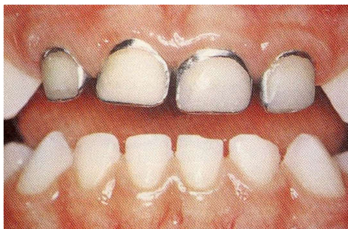
Fig. 2. Facial cut out stainless steel crown