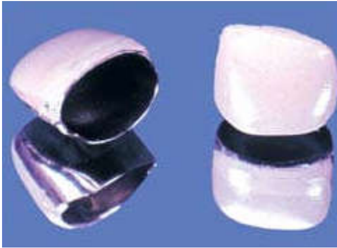
Fig. 5. Dura crowns