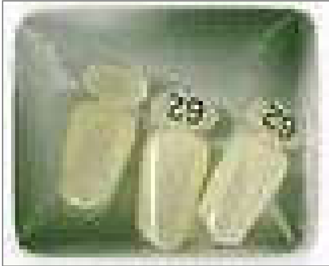
Fig. 9. Polycarbonate crowns

Polycarbonate crowns have been used since many years because of their esthetic appearance. These crowns were first described in the literature by Mink J.W (1973) (Sherman et al. , 1966).