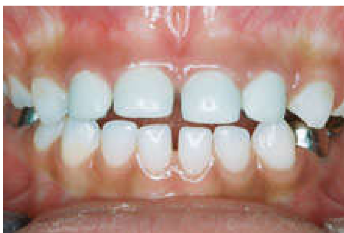
Fig. 3 Veneered stainless steel crown

It includes bonding of composite resins and thermoplastics to the metal. This type of preveneered crown was developed to be a convenient, durable, reliable, and esthetic. Various commercially available veneered SSCs include Cheng crowns, Kinder crowns, Nu-smile and Whiter biter, pedo compu crowns and Dura crowns.