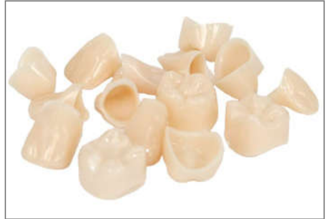
Fig. 10. Kudos crowns

permanent dentition. These are commonly used Crown forms filled with composite & bonded on the tooth (Kupietzky et al. , 2003). Their superior esthetic appearance has made them popular among other esthetic crowns. Composite strip crowns rely on dentin and enamel adhesion for retention. Therefore the lack of tooth structure, the presence of moisture or hemorrhage contributes to compromised retention.