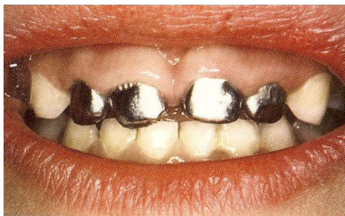
Fig. 1. Stainless steel crowns

technique is time consuming and metal margins are still visible. Clinicians even face problems to control hemorrhage during application of composite facing. 7