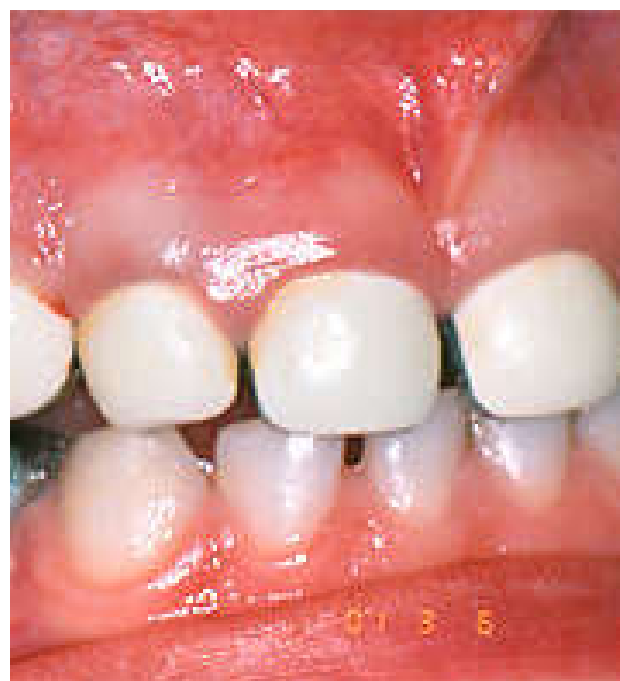
Fig. 4. Cheng crowns

Cheng Crowns are Stainless steel pediatric anterior crowns faced with a high quality composite, mesh-based with a light cured composite. It presents a unique solution for natural-looking Stain-resistant Crowns. It is available for the right and left central and lateral as well as cuspids. Most crown procedures can be completed in one patient visit and with less patient discomfort (Baker et al. , 1996). It is available in short and regular lengths and sizes suitable for centrals, lateral and cuspids. They can undergo heat sterilization without significant effect on their bond strength and color. Disadvantages of all preveneered crowns are fracture of veneers during crimping and they are expensive (Baker et al. , 1996). It is a Stainless steel crown faced with high quality composite. It is claimed to be color stable, plaque resistant and suitable pedo-shades. It doesn't cause wear of opposing teeth. It is available in upper and lower right & left central and lateral with 6 sizes (Suzan Sahana, et al. , 2010).