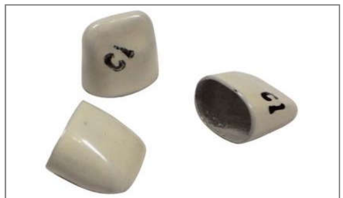
Fig. 8. Pedo pearls

These are beautiful heavy gauge aluminum crowns coated with FDA food grade powder coating and epoxy-resin. They serve as ultimate permanent crown for primary teeth.