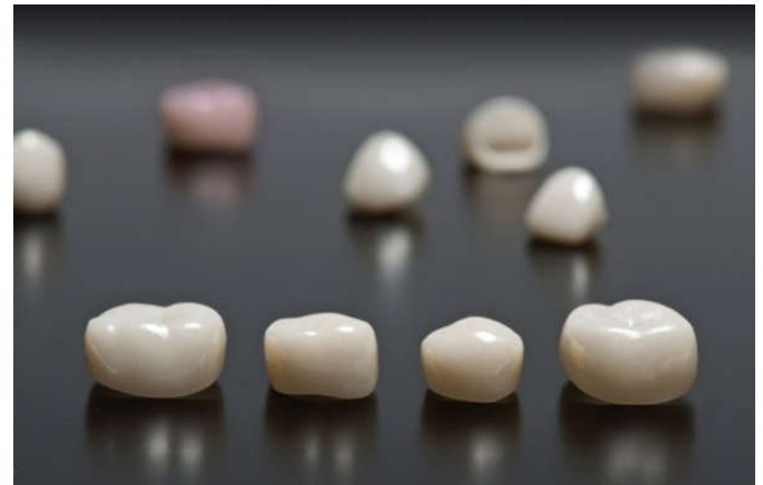
Fig. 7. Nusmile crowns