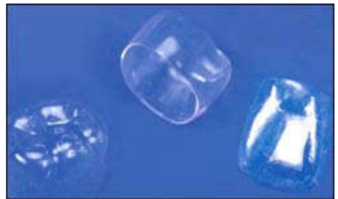
Fig. 11. Strip crowns