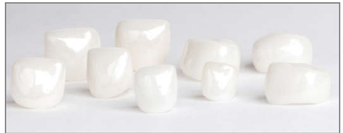
Fig. 12. Zirconia crowns

treatment of primary teeth. The preparation of tooth for zirconia crown will take more time than other tooth preparation, and so this could be disadvantageous to be used for children who are fearful and unable to cooperate for longer procedures. Difficulty in adjustment as these crowns are ceramic in nature and cannot be trimmed with scissors like the one used for SSC, it is necessary to use a high speed, fine diamond burs with lots of water because excessive heat could cause fractures in the crown's ceramic structure. Occlusal and interproximal adjustments are not recommended, as these will remove the crown's glaze and possibly create a weak area of thin ceramic. It is very important that zirconia crowns fit passively because they are made of solid zirconia and do not flex, attempt to sit with force will result in fracture and adjustment with bur result in microfracture. The appropriate size crown should fit passively and completely subgingivally without distorting the gingival tissue (Karaca et al. , 2013; Soxman, 2015). Another concern is cementation. Etching and bonding is difficult as there is lack of silicone of glass ceramic. Conventional or self-adhesive resin cements have been recommended as luting agent for zirconia crowns (Planells del Pozo, 2014; Stawarczyk et al. , 2012).