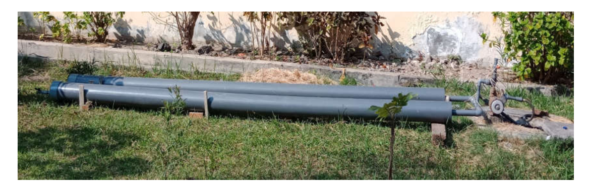
Fig. 2. Tripikon Infiltration Model