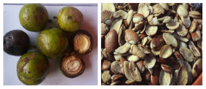
Fresh fruit photography Dry almonds photography

Population and economic activities: Population of the municipality of Daloa is estimated at 319487 inhabitants (INS, 2014) and is the third most populous city in Côte d'Ivoire. The population is cosmopolitan and made up of autochthonous ethnic groups (Betes, Gouros, Gueres and Nianbouas), allochtones (Baoules, Malinkes, Senoufos, Agnis, Atties, etc.). The foreigners are mainly nationals from ECOWAS (Burkinabe, Malians, Ghanaians, etc.). The economic activities of the population are dominated by trade and the agricultural sector. Non-native and non-native speakers from other localities are the most involved in this sector.