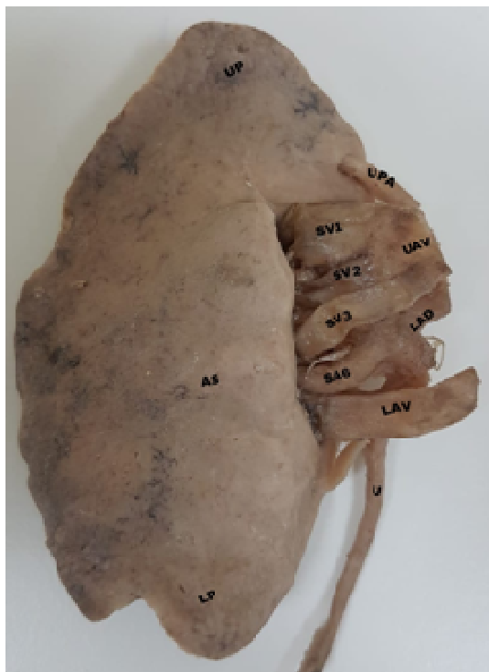
Figure 2. Anterior aspect of the right kidney: UP= upper pole, UPA=upper polar artery, UAV= upper anterior renal vein, SV1= first segmental vein, SV2= second segmental vein, SV3= third segmental vein, LAD= lower anterior division of the renal artery, SA6= sixth segmental artery, LAV= lower anterior renal vein, U= ureter, AS=anterior surface of the kidney, LP= lower pole.