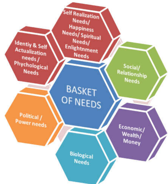
Figure 1. Basket of needs