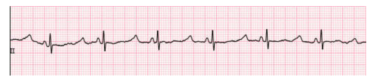
Long QT interval in ECG