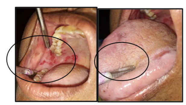
Fig 1. Clinical presentation of lesions