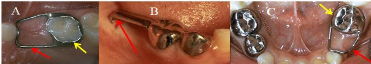
Figure 2: Fixed unilateral space maintainer: A. Band and Loop Space Maintainer. Yellow arrow indicates the band and red arrow indicates the loop. B. Distal Shoe Space Maintainer. Note that an extension segment (distal shoe) is soldered to the crown, where the segment is extended into the tissue against the unerupted first permanent molar, shown by red arrow. C. Crown and Loop Space Maintainer. Note that stainless steel wire is soldered to the stainless steel crown shown by yellow arrow and the wire is bent so that it is adapted closely to the tissue, shown by red arrow