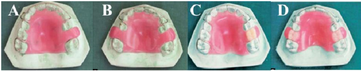
Figure 1: Removable space maintainer: A. Unilateral Non-functional; B. Bilateral Non-functional; C. Unilateral Functional; D. Bilateral Functional