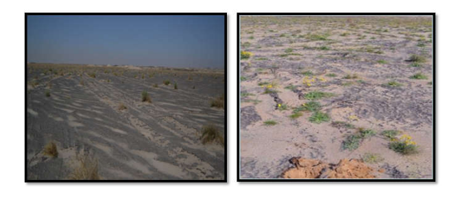
Fig.01. Tarcrete contamination in SEK & NK fields

The historical studies Consortium of International Consultants (CIC) investigation, 2002 (3) & 2003 (4); KOC/AMEC E&T and Site Soil Characterization (SSC), 2014-2017 (5) ;AMEC Foster Wheeler Limited Scope Site Soil Characterization, August 2015 (6); Worley Site Soil Characterization FEED report, 2019 identified approximately 198 km2 of area in Kuwait damaged/covered by tarcrete. This included approximately 19.8 km2 in the North Kuwait oilfields and 175 km2 in the South Kuwait oilfields. In addition, approximately 3.2 km2 of tarcrete-affected land was identified outside the fence of the Burgan oilfield.