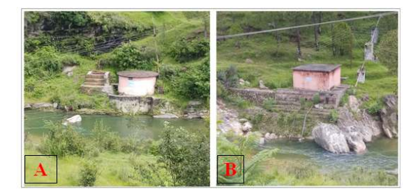
Plate 2. Typical example of lift irrigation in the Upper Kosi watershed: A- Pumping House at village Pakhura and B-Pumping House at village Kaleth

Lift Irrigation: Under the lift irrigation method, water facilities for irrigation purposes are provided to the higher elevation from the lower elevation with the help of electric pumps and other equipment. In simple words, lift irrigation is a method of irrigation which provides water at a higher elevation. The lift irrigation method is power-consuming, viz., the electric power is used to lift the water from a perennial source of water to the major storage destination point of the irrigation command area. Then, the water is allocated to the agricultural fields through distribution systems such as canal networks and pipelines etc (Shiyeker and Patil, 2017). Pumping equipment, pump house and electric power are essential for the development of lift irrigation, canal length, discharge and CCA is presented in the following paragraphs.