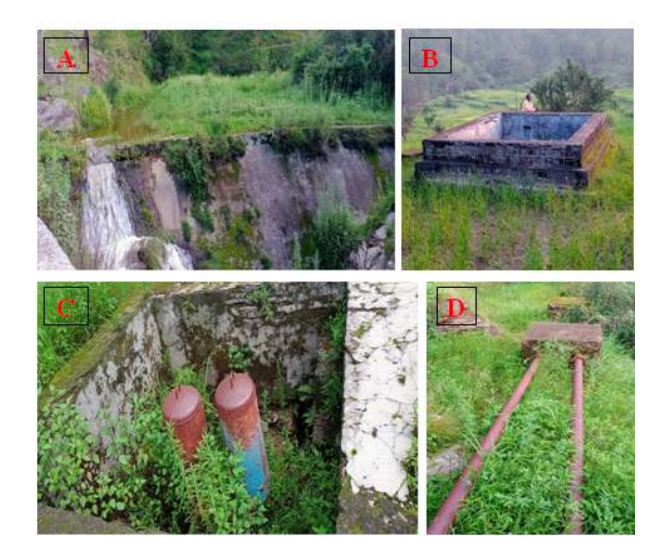
Plate 3. Typical example of hydrum infrastructure of Chan Hydrum in the Upper Kosi watershed: A- Check Dam, B- Water Storage Tank, C- Hydrum Pump and D- Pipeline

The total length of lift irrigation in the study area is 21.49 km and the total beneficiary villages of these lift irrigation schemes are 17 (Table-6). The average length of canals of the study area is 1.26 km which varies between 0.060 km as the minimum to 3.80 km as the maximum. All the lift irrigation schemes of the study area can be divided into three groups according to their length. Out of the total lift canal length, 41.18% falls under small canal group having length less than 1 km, 41.18% falls under medium canal group having length between 1 to 2 km and the remaining 17.65% canal falls under large canal group having length more than 2 km.