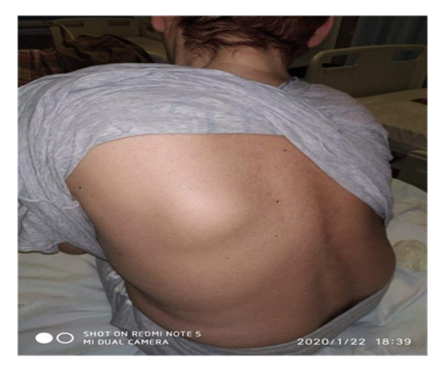
Image 1. Elastofibroma dorsi located Infrascapular in a female patient