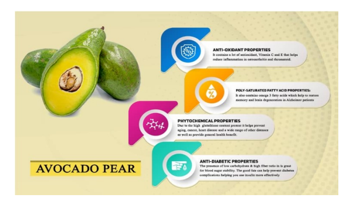
Figure 2. Showing the health benefits of avocado pear [11–13]