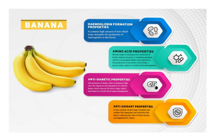
Figure 5. Showing the health benefits of banana [20, 21]