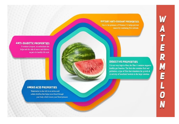
Figure 3. Showing the health benefits of watermelon [14–16]