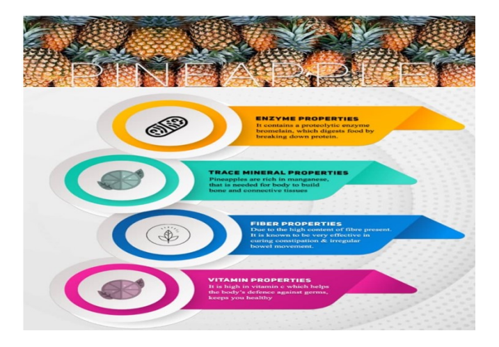
Figure 1. Showing the health benefits of pineapple [9, 10]