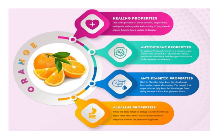
Figure 4. Showing the health benefits of oranges [17–19]

Majority (53.33%) of the respondents were married, and 43.33% (13) were unskilled. Table 2 , 100% (30) of the respondents stated that the pictographs design ful fill its educational purpose of highlighting medicinal value, giving a high perception score of 100(good level of perception). Furthermore, 93% with a high perception score of 86, and 90% with a high perception score of 80 stated that the graphic informative and the message easy to understand respectively (good level of perception).