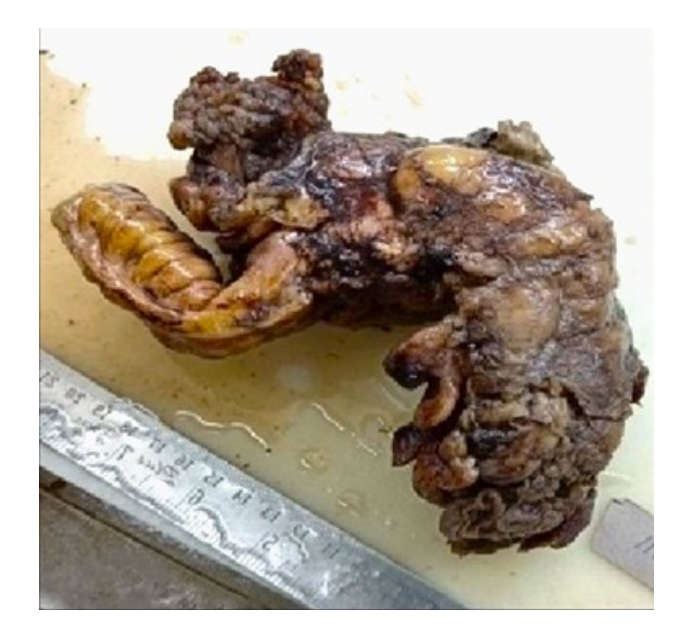
Image 1. Intestinal segment labelled as caecum, terminal ileum and ascending colon was received.Total specimen measures 32cm*3cm *2cm.Outer surface is dull, congested and necrotic