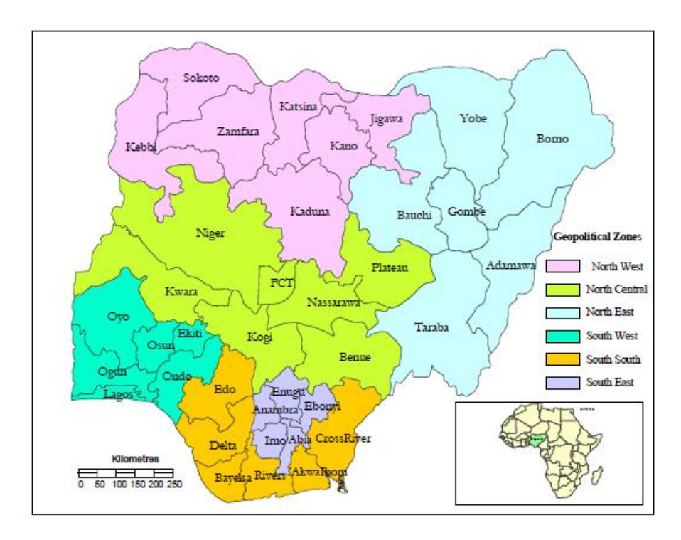
Fig. 2. Map of Nigeria Showing 36 States/FCT and 6 Geopolitical Zones

evolved as an economic development approach intended to benefit the low income part of the society. Microfinacing may not necessarily operate under a formal institution as is being believed in some quarters because it was operating in Nigeria and other parts of Africa as informal institution of a group of people that come together which was either savings and loans cooperatives, loan unionsor other non-bank institutions, before the formal establishment of Micro Finance Banks in Nigeria, previously known as Community Bank on 28<sup>th</sup> April, 1990.